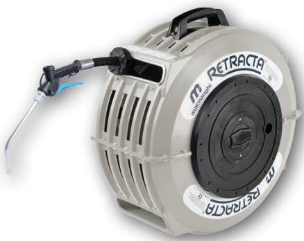
Workshop Coolant Reel with Gun