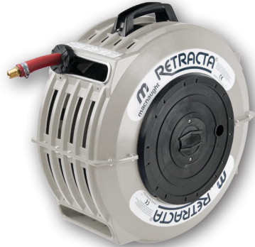
Workshop Water Reel