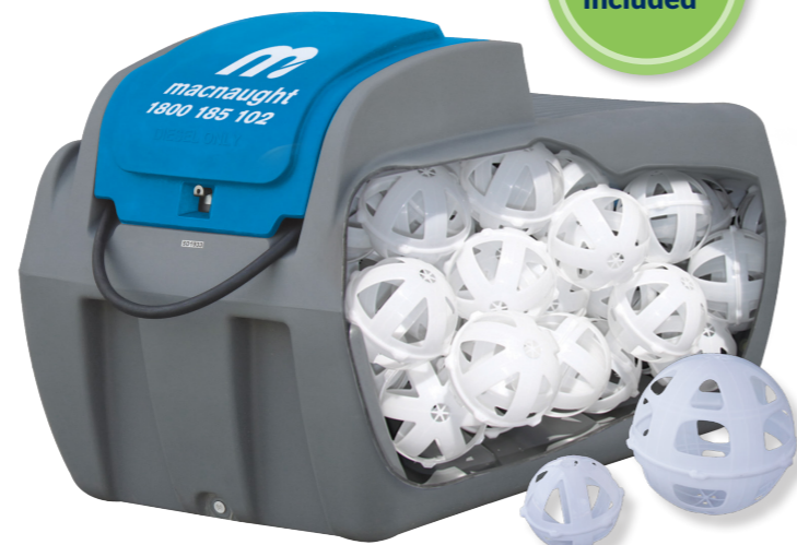
*Baffles included on MDT1000L and MDT1200L models only

Applications: Automotive, Truck and Buses, Farming, Construction and Earthmoving, Trains